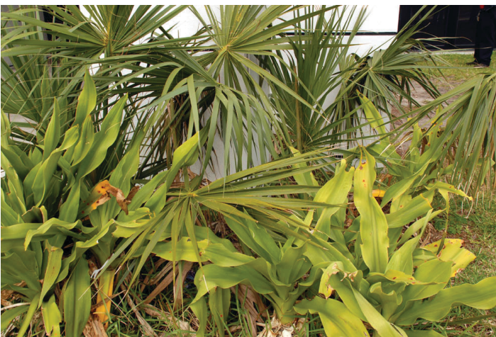
Figure 9. Dense shrubs and bushes.