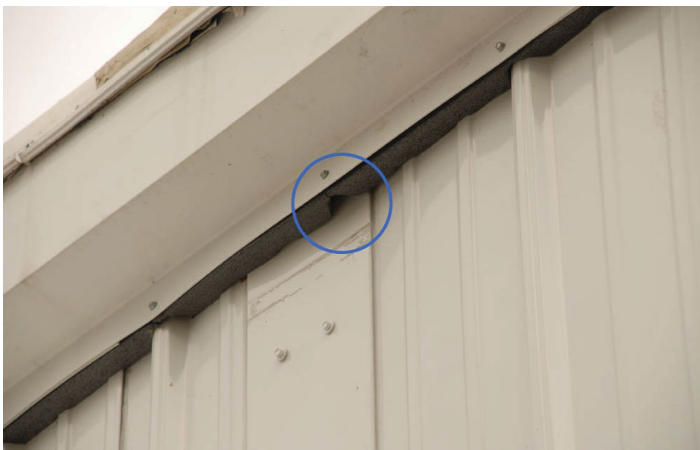
Figure 3. Small hole in siding leading to a cavity in the wall.

Although this type of nesting site may be the first choice for the bees, they certainly will nest at many other locations. Some of these locations are difficult to bee-proof; therefore, it is important that regular inspections are done to monitor for any bee activity. Examine the following pictures as a reference point for your inspections. They include examples of places that are difficult to bee-proof.