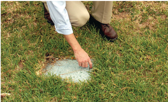
Figure 1. Closed water meter.

The first step in eliminating areas that may be attractive to honey bee nests is actually these areas—think like a swarm. What areas might bees favor as a nesting site? AHBs, especially, have been known to nest almost anywhere, yet all honey bees favor certain sites over others. Sites that are potentially attractive to honey bee colonies consist of a small opening that accesses a protected cavity. Examples are water meters, manholes, holes in a structure that lead to open space inside a wall, gutter down-spouts, pipes, etc. Examine these photos as a reference.