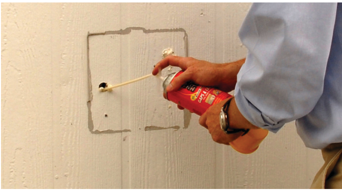
Figure 21. Foaming holes in side of a building.

Expanding/insulating foam sealant is useful for sealing holes/cracks in walls. If foam is exposed to weather, be sure to paint the exposed surface to prevent cracking or eroding of the foam.