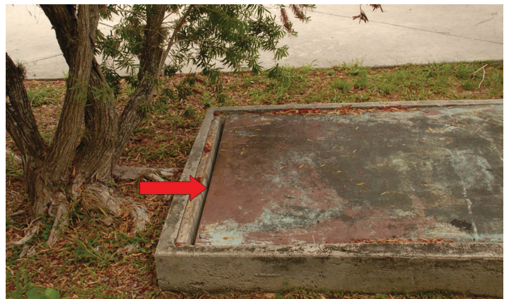
Figure 5. Open space in metal drain cover.