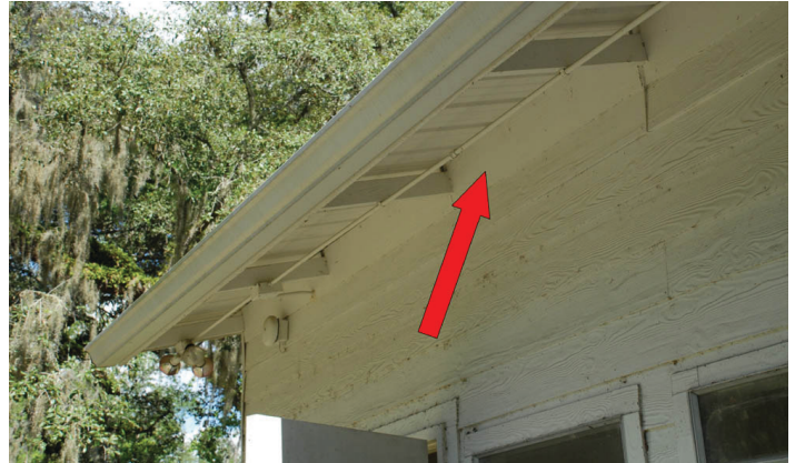
Figure 11. Under eave of house.