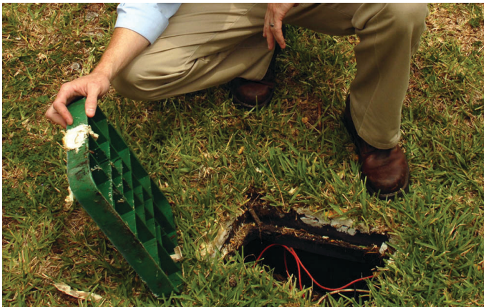
Figure 2. Open water meter.