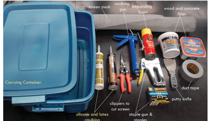
Figure 22. Bee-proofing tools.

Silicone and latex caulking, caulking gun, roll of screen mesh, clippers to cut screen, staple gun, staples, wood filler, concrete filler, putty knife, duct tape, expanding foam, and carrying container.