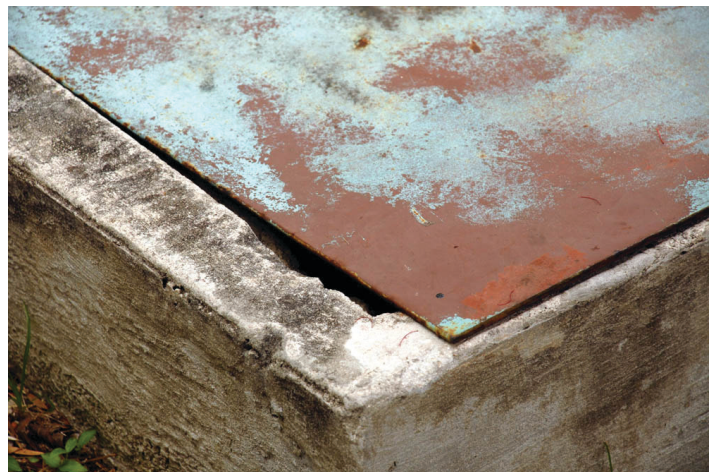
Figure 6. Crack in cement that creates opening.