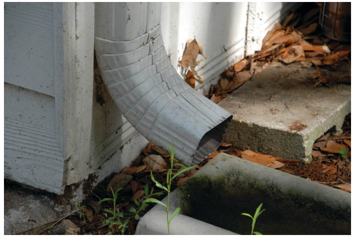
Figure 18. Gutter downspout.