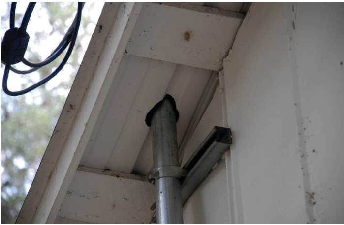
Figure 14. Opening around pipe.