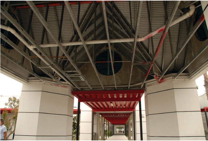
Figure 7. Large recess under roof.