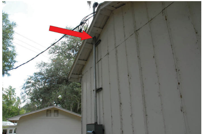
Figure 13. Opening around pipe.

Other sites where colonies have been found include eaves, hollow trees, abandoned vehicles, empty containers, fence posts, lumber piles, utility infrastructure, old tires, tree branches, garages, outbuildings, sheds, walls, chimneys, playground equipment, etc.