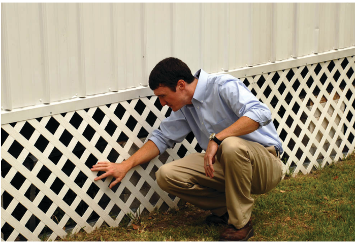
Figure 8. Inspecting under house.