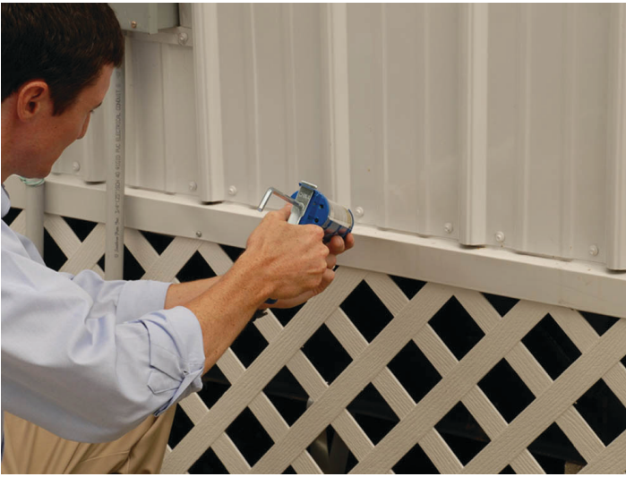
Figure 20. Caulking opening in siding.