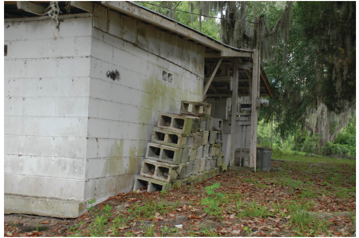
Figure 10. Cinderblocks.