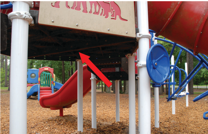
Figure 15. Under playground equipment.