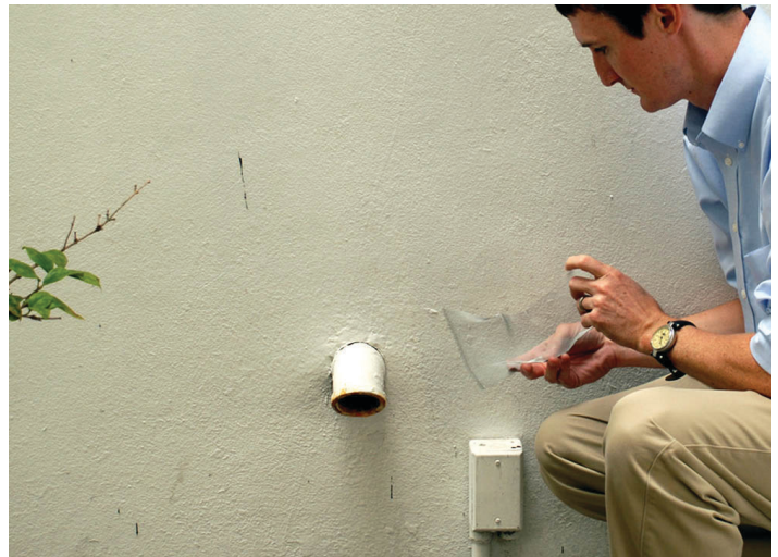
Figure 19. Placing screening over pipe.

Close off areas by stapling or attaching 1/8 th inch hardware cloth or standard insect screen over the hole. This method is preferred for restricting access to voids in trees; also, it is best for closing off vents, drains, downspouts, or other plumbing as the screen allows air/water to pass through while stopping bees from entering.