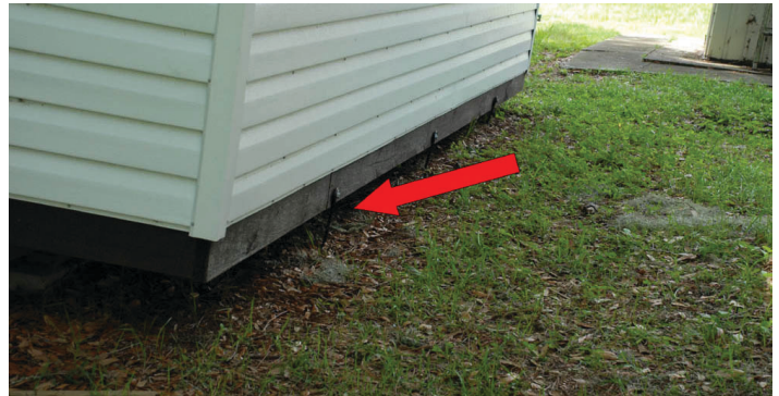
Figure 12. Opening under shed.