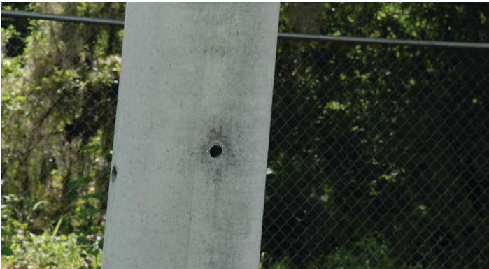
Figure 16. Small hole in power pole.