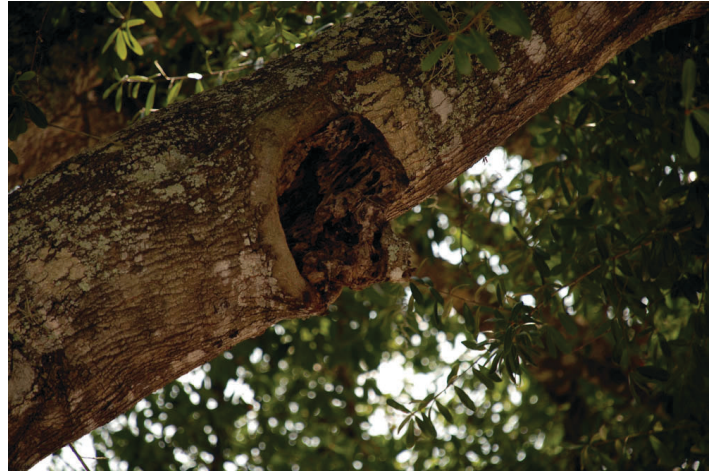
Figure 4. Cavity in a tree branch.

Although this type of nesting site may be the first choice for the bees, they certainly will nest at many other locations. Some of these locations are difficult to bee-proof; therefore, it is important that regular inspections are done to monitor for any bee activity. Examine the following pictures as a reference point for your inspections. They include examples of places that are difficult to bee-proof.